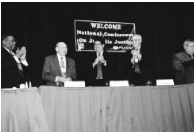
The National Conference on Juvenile Justice honored Judge Nicholas Cipriani (second from left) of Philadelphia for his contributions to Juvenile Court and Juvenile Justice.