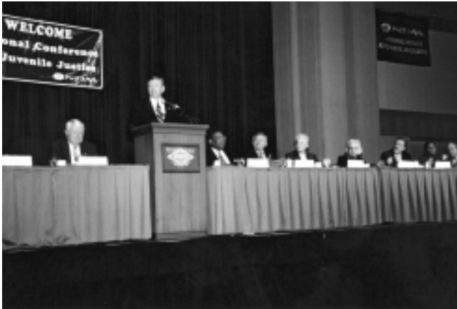
U.S. Attorney General John Ashcroft spoke on juvenile crime projects sponsored by the Justice Department.

SPONSORED BY THE NATIONAL COUNCIL OF JUVENILE AND FAMILY COURT JUDGES AND THE NATIONAL DISTRICT ATTORNEYS ASSOCIATION