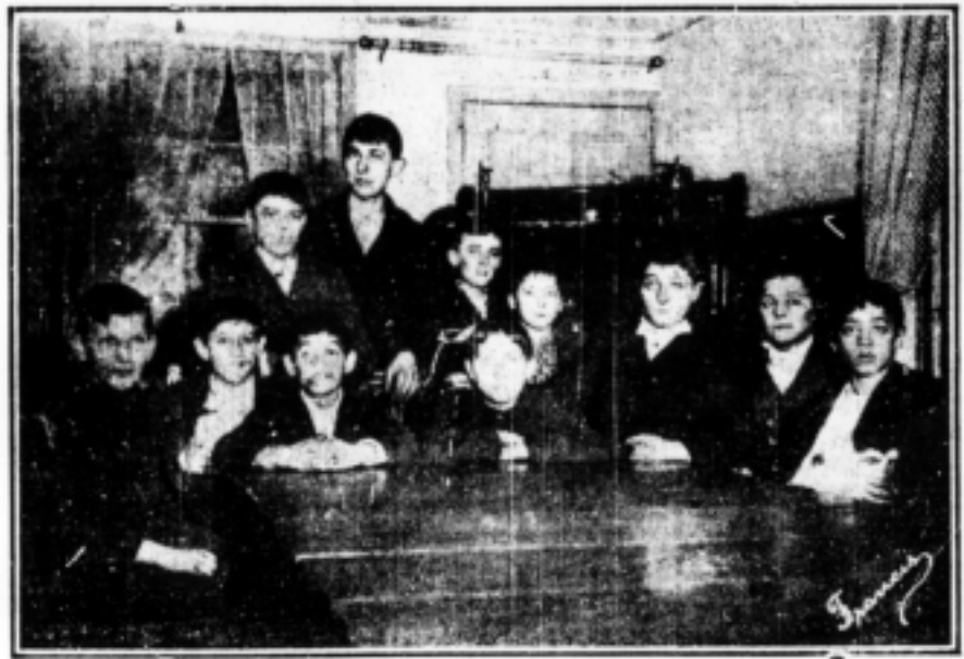
TYPICAL PRISONERS IN THE JUVENILE COURT. (Photograph taken in the Philadelphia Court.)

The highest ambition of this child's life is that he may learn to become a barber. His face fairly beamed as he spoke of his future, for, having the offer of an apprenticeship from a